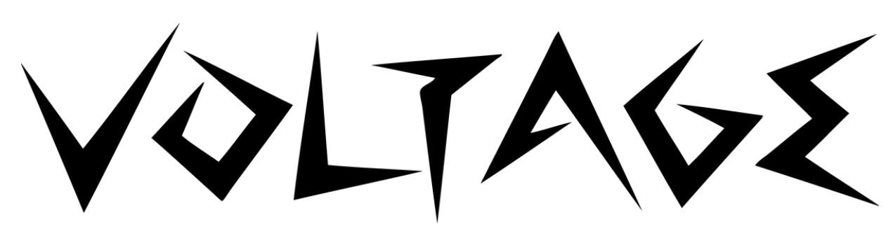
TABLE OF CONTENTS - COMPETITION DIVISION